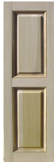
INT-DE-RP Decorative Inset Molding