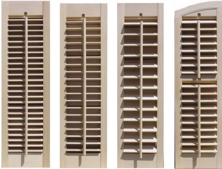
MLIP 1 7/8" Louvers MLIP 2 1/2" Louvers MLIP 3 1/2" Louvers MLIP Small Curve (shown w/cross rail)