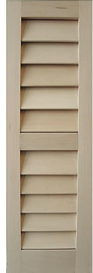
INT-DE-FL Traditional 3 1/2" Louvers