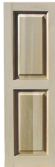
INT-DE-RP 1/4 Round Inset Molding