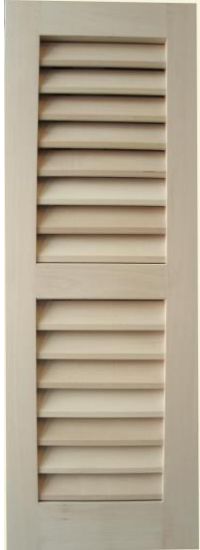
INT-DE-FLE European Flat Edge 2 1/4" Louvers