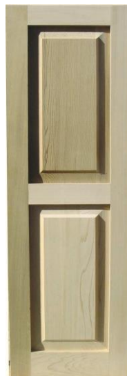
INT-DE-RP Raised Panel

These hefty interior raised panels are used as doors on pantries, closets, cabinets, shelving, and more. Flush sanded mortise & tenon construction allows for inset or surface trim options. Available in raised or flat panel styles. Add 10% for stain grade basswood. Call for quote using red oak or mahogany.