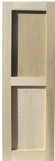
INT-DE-FP Flat Panel