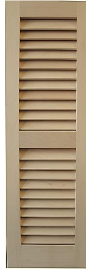
INT-DE-FL Traditional 1 7/8" Louvers

These hefty interior fixed louvers are used as doors on pantries, closets, cabinets, shelving, and more. Flush sanded mortise & tenon construction allows for surface trim options. Prices are unfinished paint grade. Add 10% for stain grade basswood. Call for quote using red oak or mahogany.