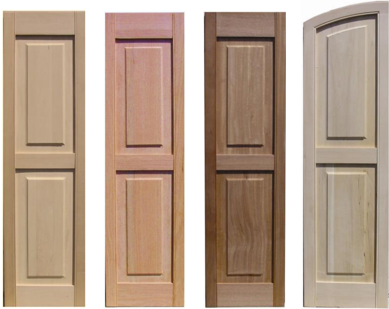
RPI BASSWOOD RPI RED OAK