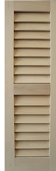
INT-DE-FL Traditional 2 1/2" Louvers