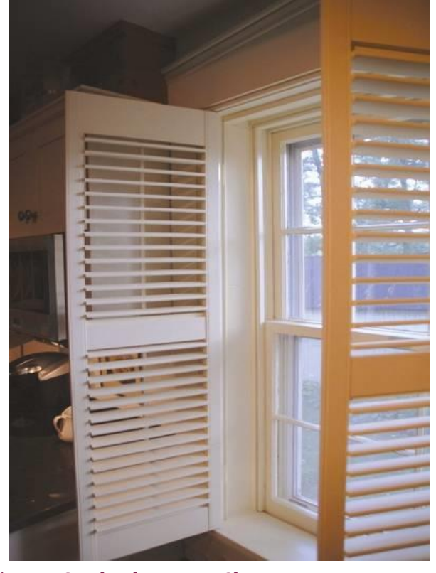
*Paint Grade Plantation Shutter Pricing on page 2 includes vacuum (pre-sanded) prime coat on shutters with normal specifications

Choose any national Brand, Color, & Sheen and we'll do the rest! (Waterbased Products Only)