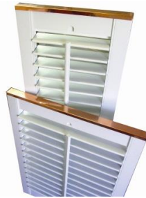
SOLID COPPER CAPPING