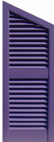
CHAMFER (SLANT CUT)