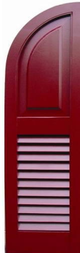
COMBO WITH 1/4 CIRCLE