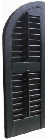
1/4 CIRCLE (SOLID SUPPORT IN ARCH)