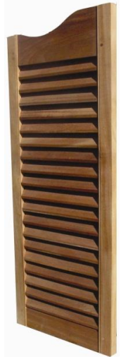
CAFÉ CURVE TOP