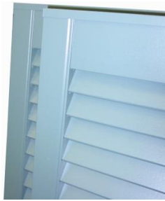
PAINTED ALUMINUM CAPPING