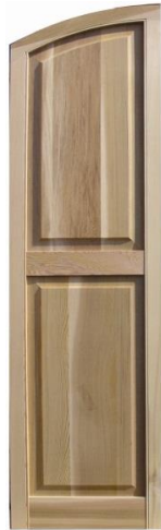
SMALL CURVE EYEBROW RADIUS