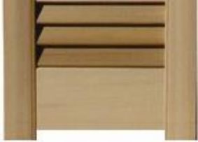
BOSTON STYLE HORNS