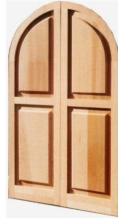
PANELS WITH 1/4 CIRCLE