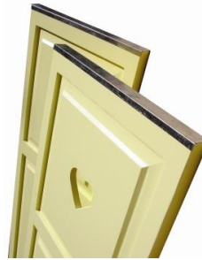
LEAD COPPER CAPPING (HEART CUTOUTS)