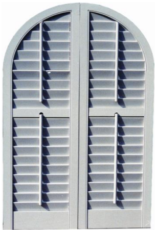
1/4 CIRCLE (LOUVERS THROUGHOUT ARCH SECTION)