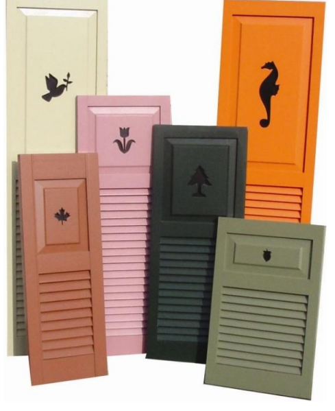
Shutter can be split anywhere you choose! Many cutout sizes available.