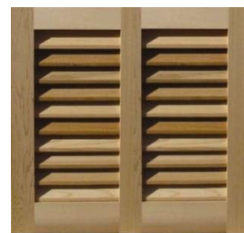
No Center Rail - Short