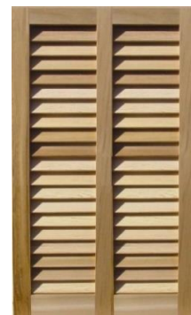
2 1/2" Louvers Shown with no center rail