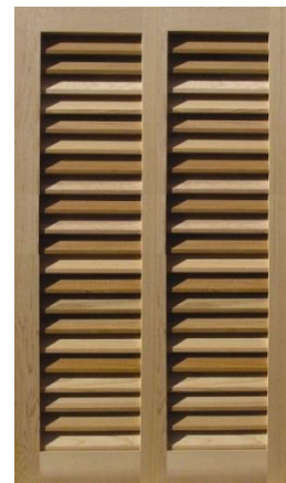
No Center Rail - Tall