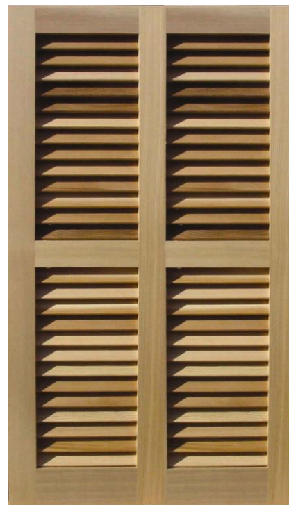
Shown With 1 7/8" Louvers Substyle and Center Cross Rail