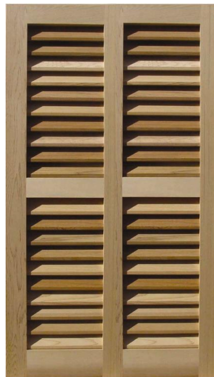
Shown With 2 1/4" Beveled Louvers Subtile and Center Cross Rail